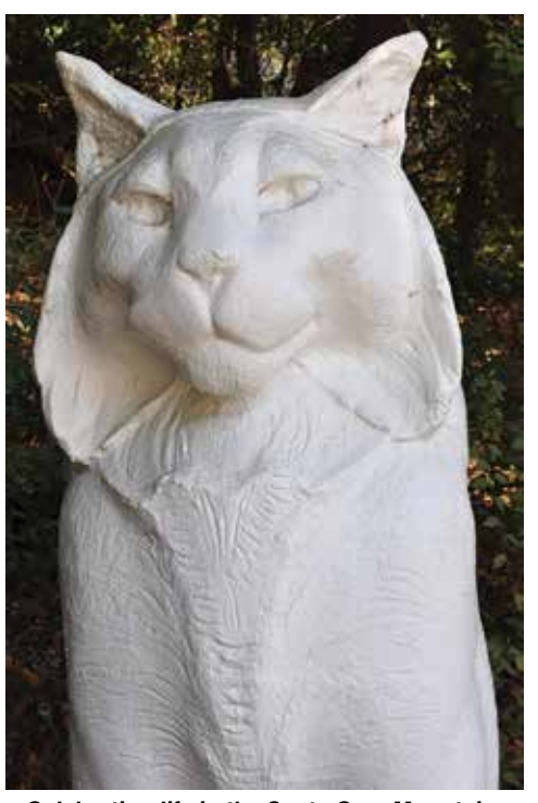
Celebrating life in the Santa Cruz Mountains